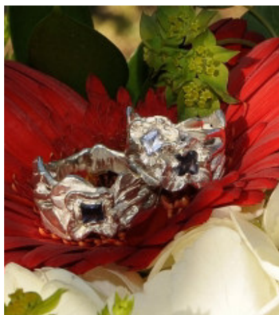
'Lilac Wedding Bands' - Sterling Silver and Iolite, Wax Cast, Hand Finished. By Rachel Morris.